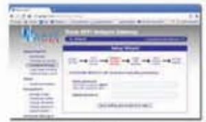
(3) Setup HotSpot Name