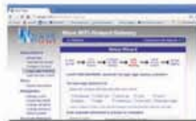
(4) Login Page Background