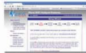
(2) Test Internet Connection