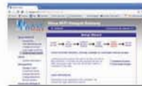
(5) Set Access Level