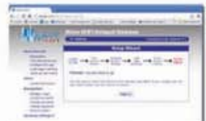
(6) Setup Complete - Reboot